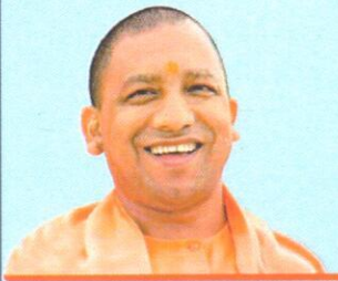
Shri Yogi Adityanath Chief Minister, Uttar Pradesh