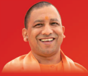
Yogi Adityanath Chief Minister, UP