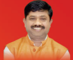
Shri Nand Gopal Gupta 'Nandi' Hon'ble Cabinet Minister of Industrial Development, Uttar Pradesh