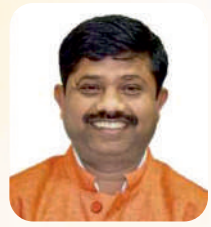
Nand Gopal Gupta 'Nandi' Minister of Industrial Development Uttar Pradesh