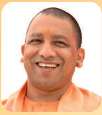
Yogi Adityanath Chief Minister, U.P.